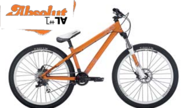
Versatile geared dirt / park rig