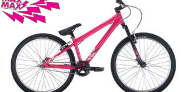
Super affordable, bombproof starter bike