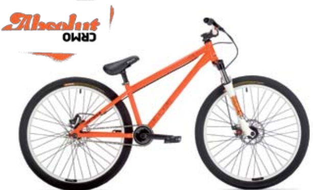
Premium trail and urban assault vehicle